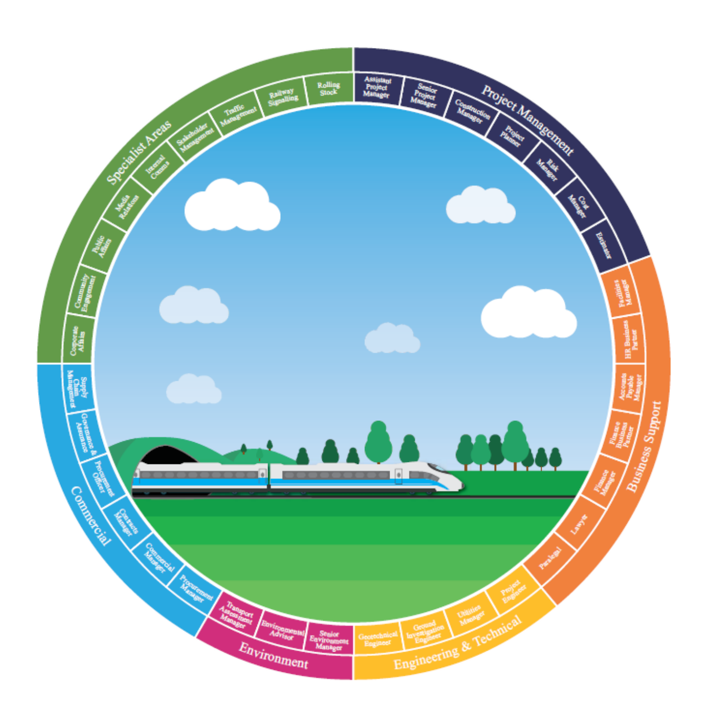
HS2 Opportunities Diagram