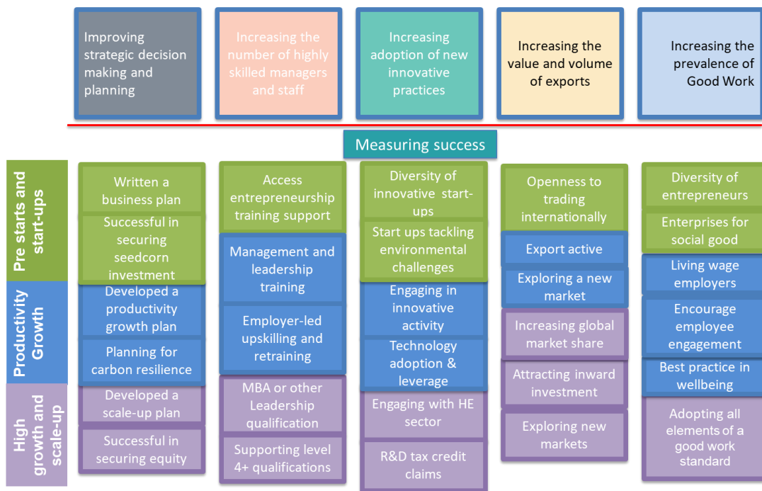
Diagram 2: Draft Measuring success framework for business behaviours

2.11 The second element of the plan relates to structural transformational opportunities that can support increased business productivity and resilience. Like for the business behaviours, for each of these opportunities the plan outlines proposed actions: